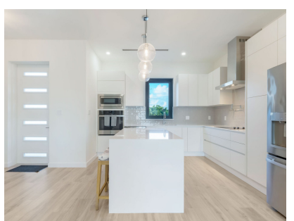
PHASE 2- PARAISO RESIDENCES, a remarkable lifestyle right on the water connecting all water enthusiasts to the North Sound. These oversized-modern townhomes feature 3 bedrooms/3.