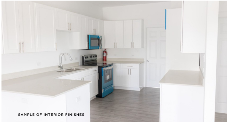
SAMPLE OF INTERIOR FINISHES