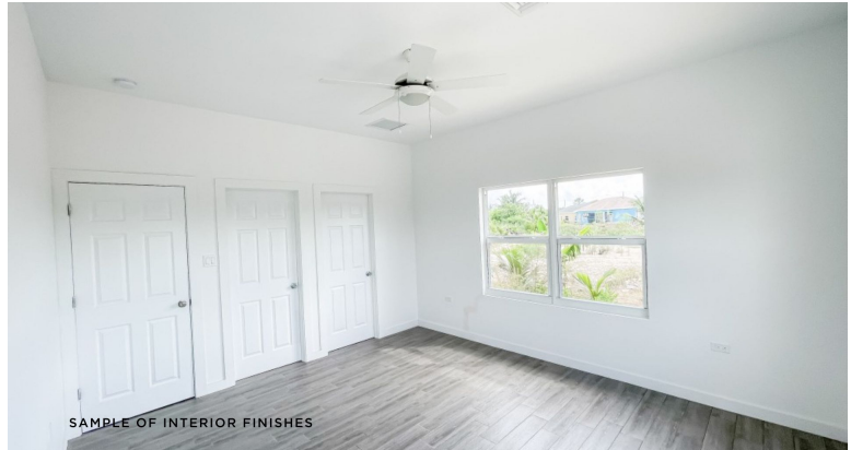
SAMPLE OF INTERIOR FINISHES